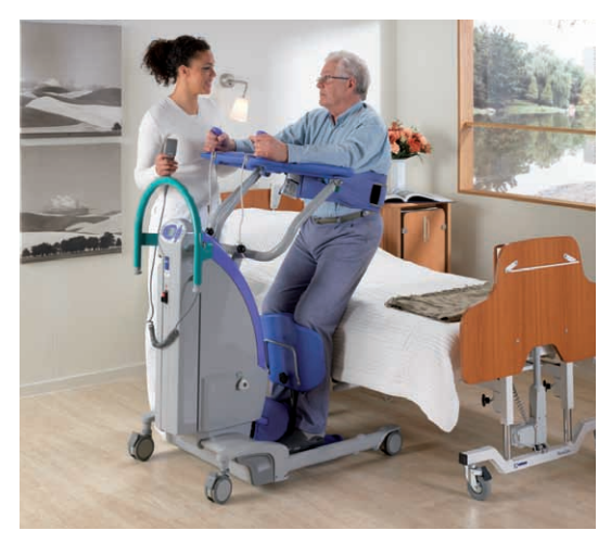
A single carer can manage transfers, safely and efficiently.

The sling is an integral part of the Comfort Circle, and a range of solutions is available to suit specific needs. In addition to the basic standing sling, a special BOS/EPS sling enables standing in a more upright position, which is more favourable for rehabilitation. The transfer/walking sling supports residents who need to be transferred in a seated position, and is also ideal for walking exercises.