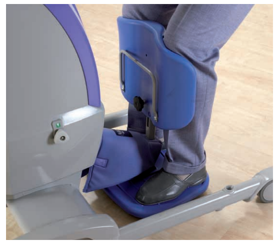
The footplate provides safety and stability, while the Pro-Active Pad allows natural flexion of the ankle.