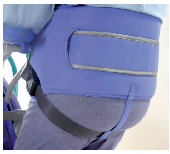
Supporting a more upright standing position makes the BOS/EPS sling ideal for rehabilitation.