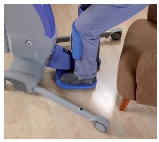
For transfers, the powered chassis can be opened for optimum access.